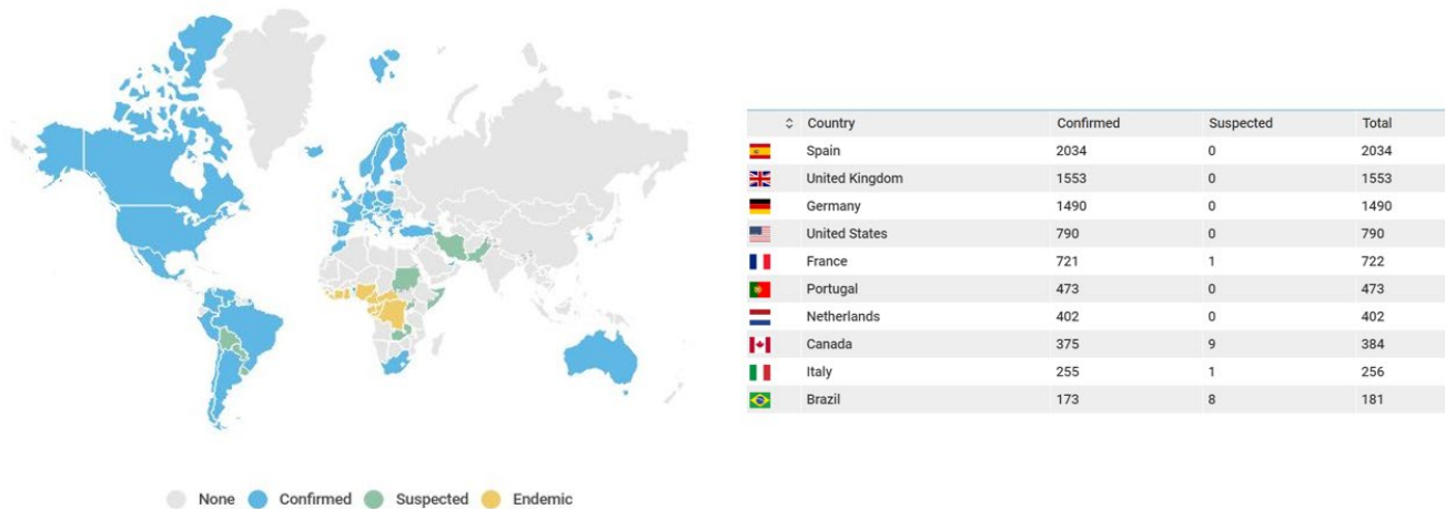
Figure 2 — Monkeypox Global Case Map Source

The number of cases continues to increase as does the number of countries with confirmed cases. At a meeting on June 23, the World Health Organization (WHO) decided against declaring the outbreak a Public Health Emergency of International Concern (PHEIC). However, the World Health Network (WHN) on June 22 declared the outbreak a Pandemic Emergency and the WHO's decision is likely to be reviewed in the coming weeks based on information on the incubation period, and the role of sexual transmission and mass gatherings. Models indicate that the UK could see as many as 60,000 new cases a day by the end of the year with some assessments that there will be as many as 100,000 cases worldwide by August and 500,000 to 1 million cases by the end of September.