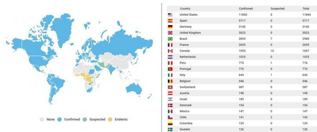
Figure 1 — Monkeypox Global Spread Monkeypox tally.info

Cases continue to increase and are doubling every 17 days. The U.S. has declared the disease a public health emergency. Nevertheless, travel or other restrictions are unlikely at this time.